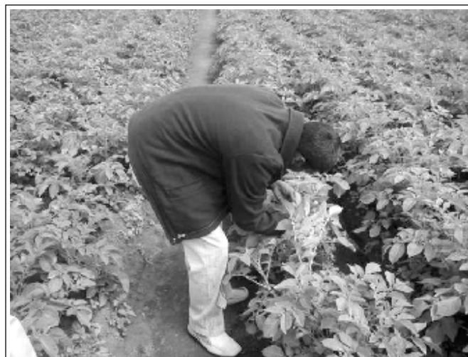
Fig 3: Potato harvest in Sri Lanka

The successful partnership was recognized at the 2012 Global Chemical Leasing Awards Frankfurt in June 2012 with a bronze medal for the project. The Sri Lankan NCPC