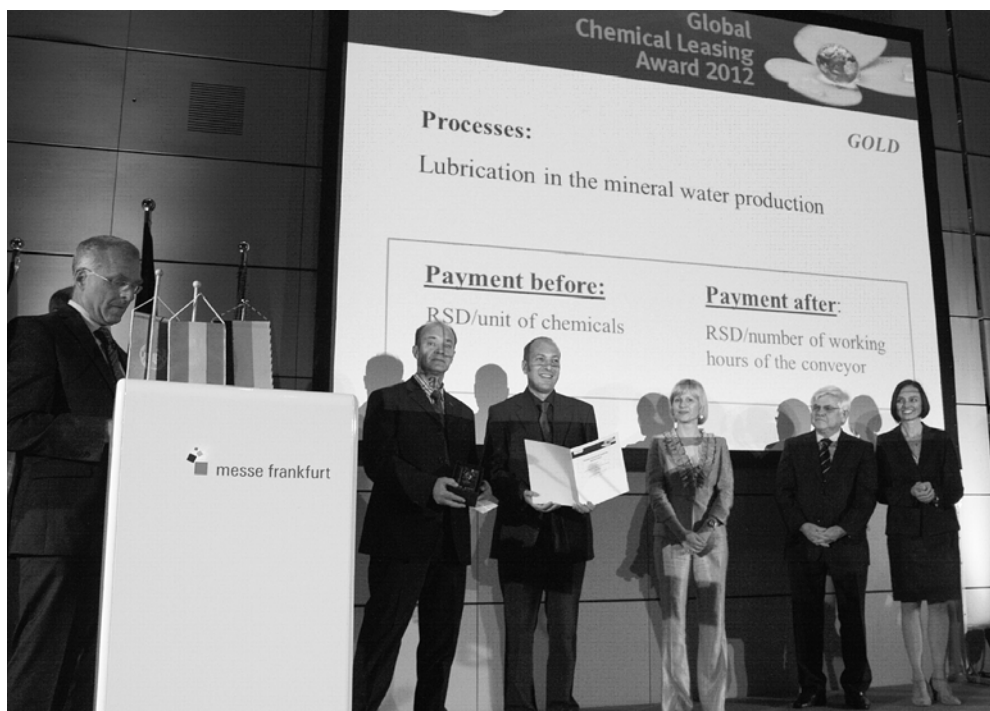
Fig 4: Awarding cases of excellence during the 2012 Global Chemical Leasing Awards