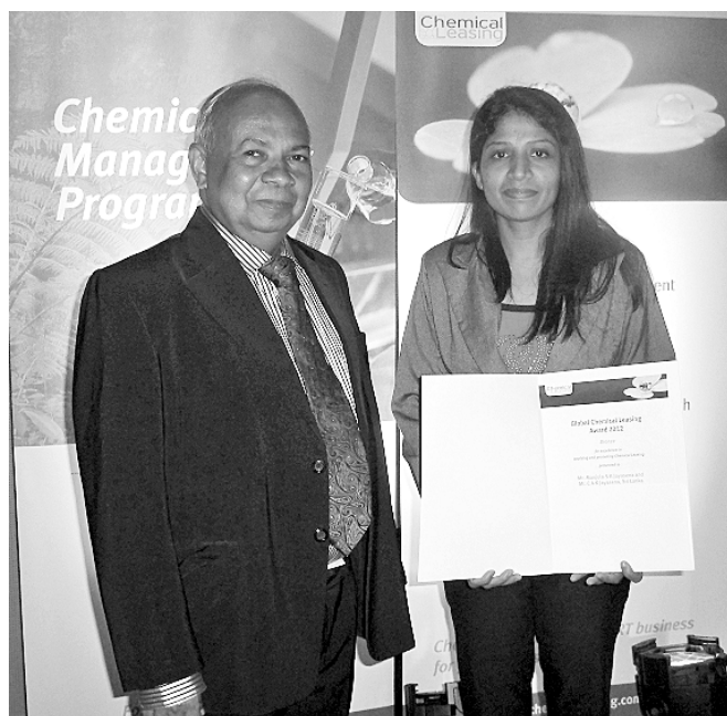
Fig 5: Sri Lankan case received a Bronze

UNIDO promotes ChL through its worldwide network of National Cleaner Production Centres. The Centres help companies prepare ChL contracts and provide them with UNIDO's ChL methodologies and tools.